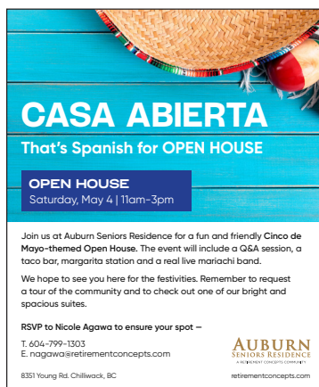
Cinco De Mayo Auburn Seniors Village