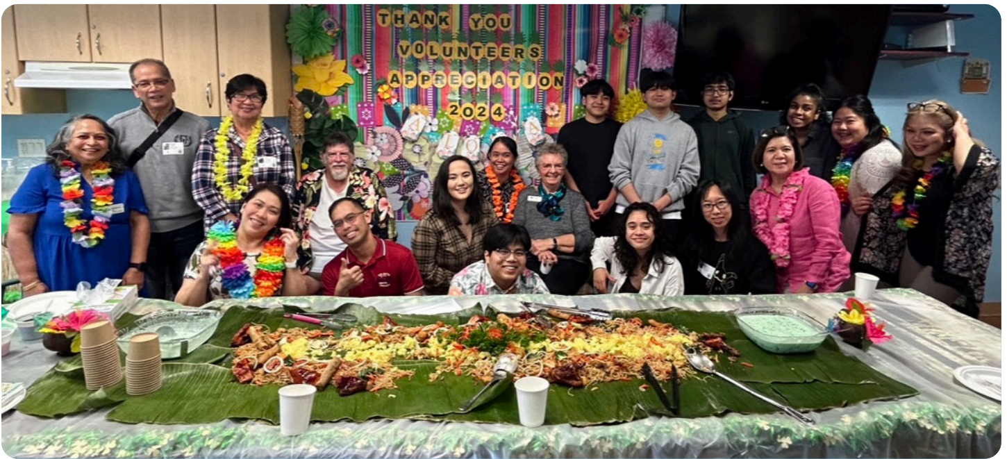
Volunteer Appreciation dinner for the GSV volunteer