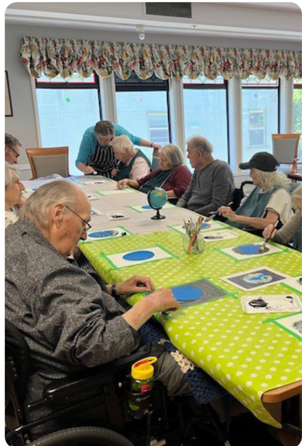
Residents of Beacon Hill Villa had a delightful time participating in Earth Day Art! They crafted stunning Earth-inspired paintings that were simply amazing.