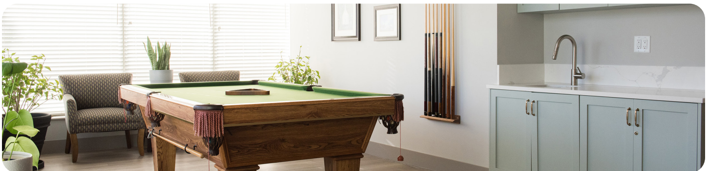
Terraces on 7th - Recreation Room