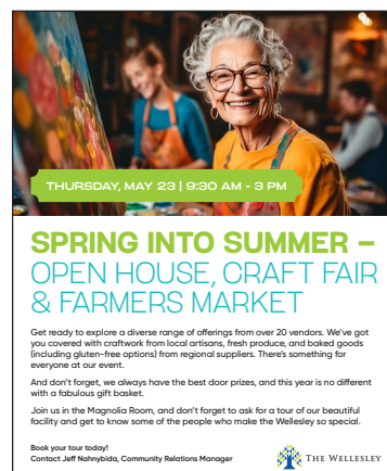
Craft Fair & Farmers Market The Wellesley