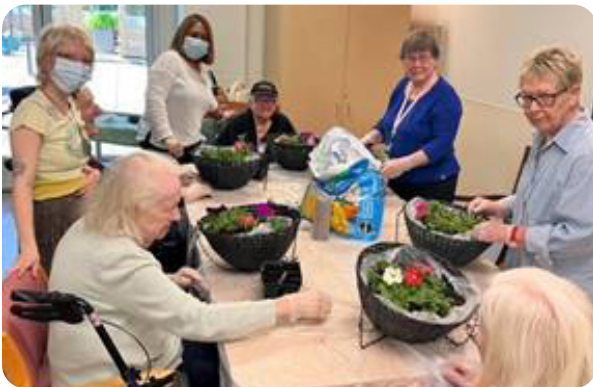
Dufferin residents working together to craft hanging baskets for the second-floor patio.