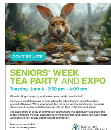
Senior's Week Tea Part & Expo Kamloops Seniors Village