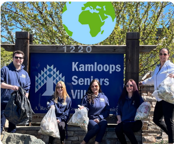
Kamloops Seniors Village Leadership took to the streets and picked up garbage in their neighbourhood!