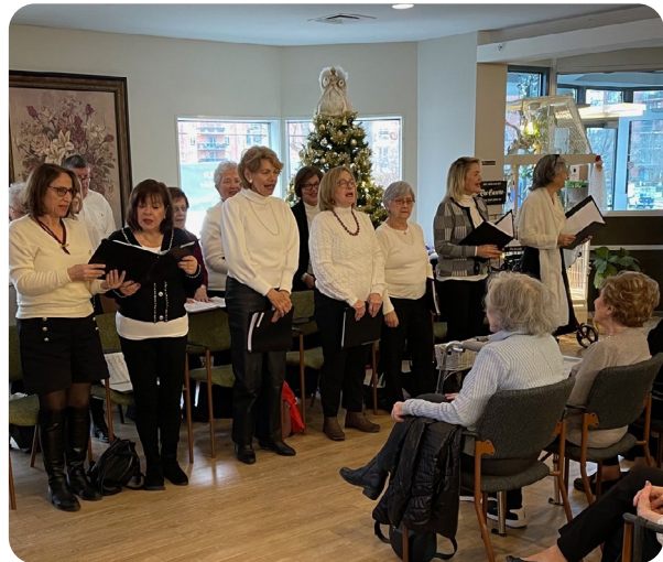
Chorale de Montpellier came to sing Christmas carols for the residents in early December