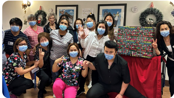
GSV team members during the food drive with (yes, you guessed it), Elvis!