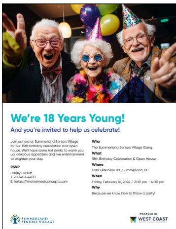
Anniversary Open House Summerland Seniors Village