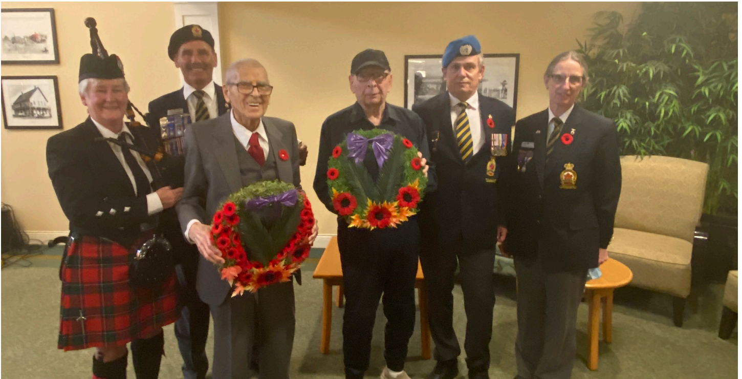
Veterans from the Courtenay Legions posing next to Comox Valley Seniors Village residents