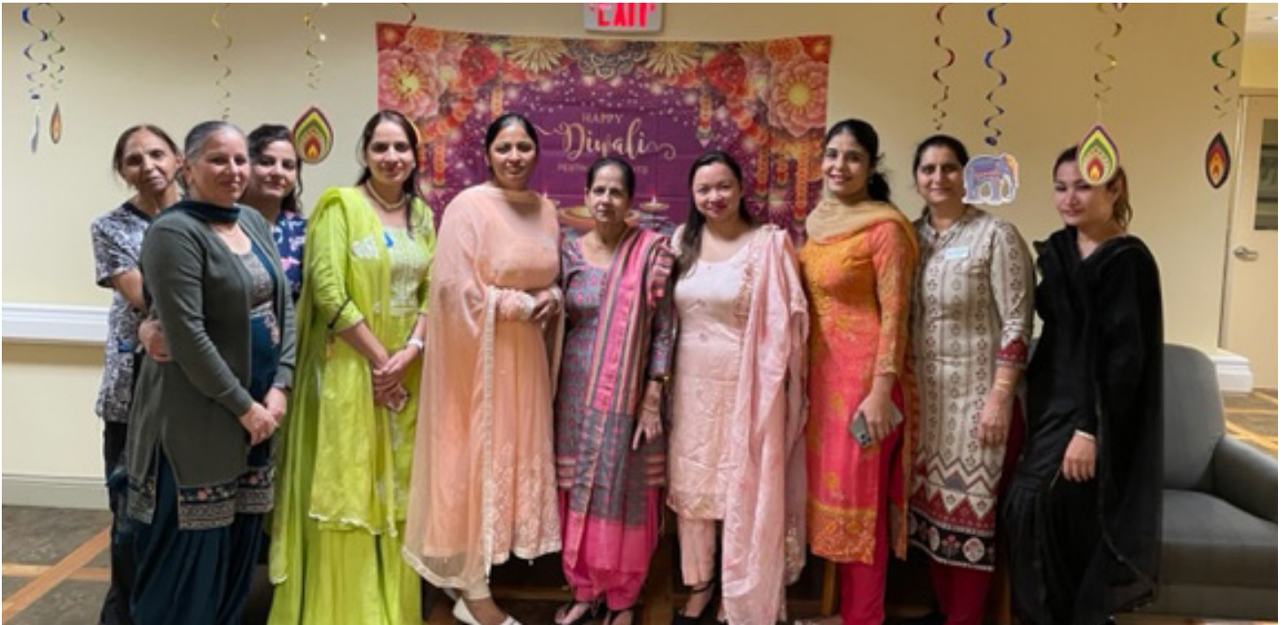
The Rosemary Heights Seniors Village community celebrating Diwali in style!