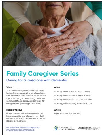
Family Caregiver Series Summerland Seniors Village