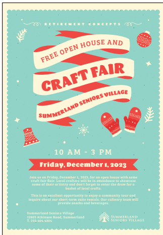
Craft Fair Poster Summerland Seniors Village