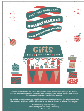
Open House & Holiday Market Comox Valley Seniors Village