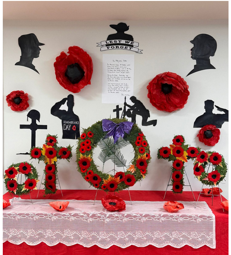
Silhouettes and wreaths remind us of those who made the ultimate sacrifice at Peace Portal Seniors Village. The famous war poem, "In Flanders Fields" by John McCrae, on display