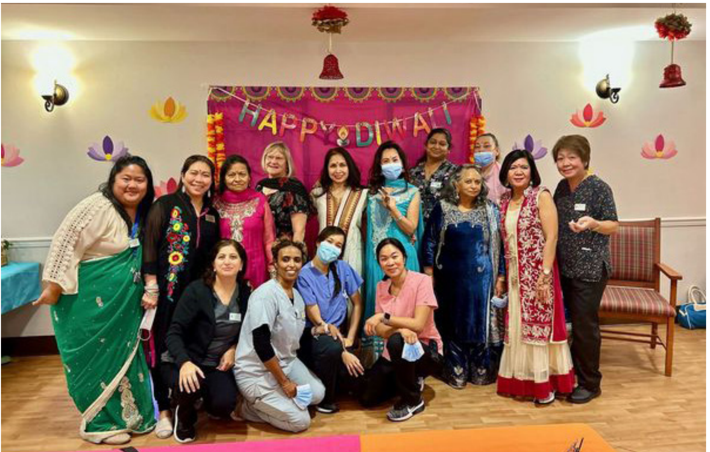
The Guildford Seniors Village team looked great during their Diwali celebration!