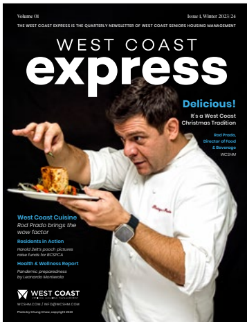
External Newsletter WCSHM