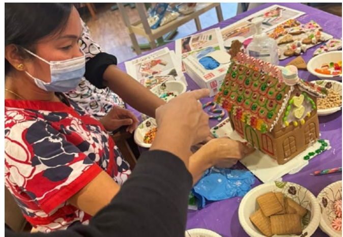
The GSV team hard at work building a gingerbread house with a table full of delicious building materials