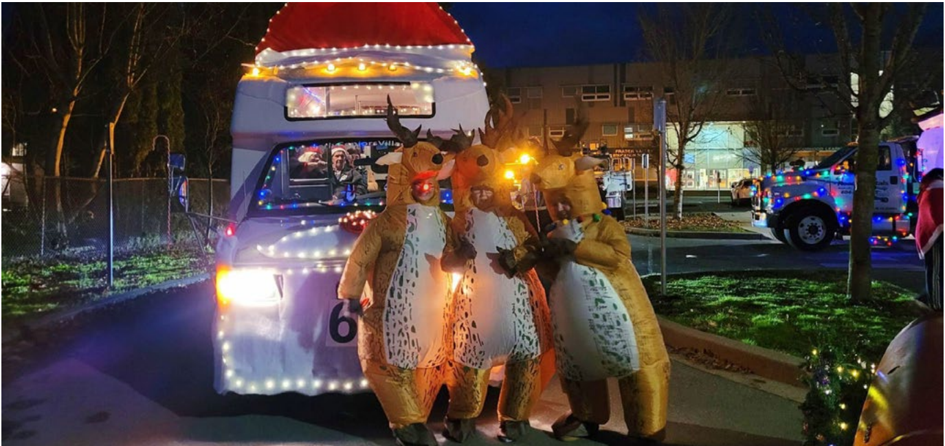
The Waverly team decorated the rec bus and got all dressed up and ready to head out into town!

Looks like Santa and his reindeer showed up at Waverly Seniors Village!