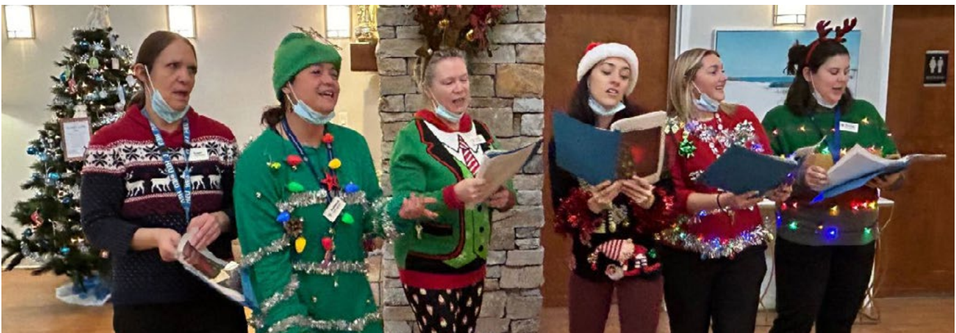
The Nanaimo Seniors Village Recreation team singing carols to the LTC and AL communities

The Recreation team at Nanaimo Seniors Village celebrated Christmas Sweater Day by spreading holiday cheer throughout the long-term care and assisted living communities.