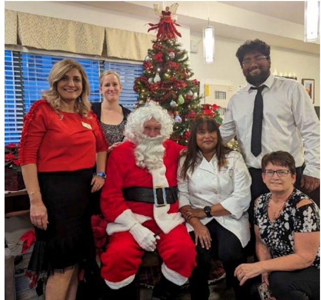
A few members of the White Rock Seniors Village leadership team with Santa at the community holiday party

The community at White Rock Seniors Village had a fantastically festive evening! The exceptional team at White Rock created a wonderful experience for both the residents and their family members. The evening began with a special visit from none other than Santa himself!